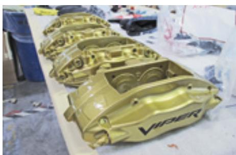
The "Gleaming Gold" brake calipers.