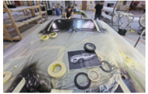
Tools of the trade—and Trostle's rendering of the car (Krugger (L) and Trostle in background).