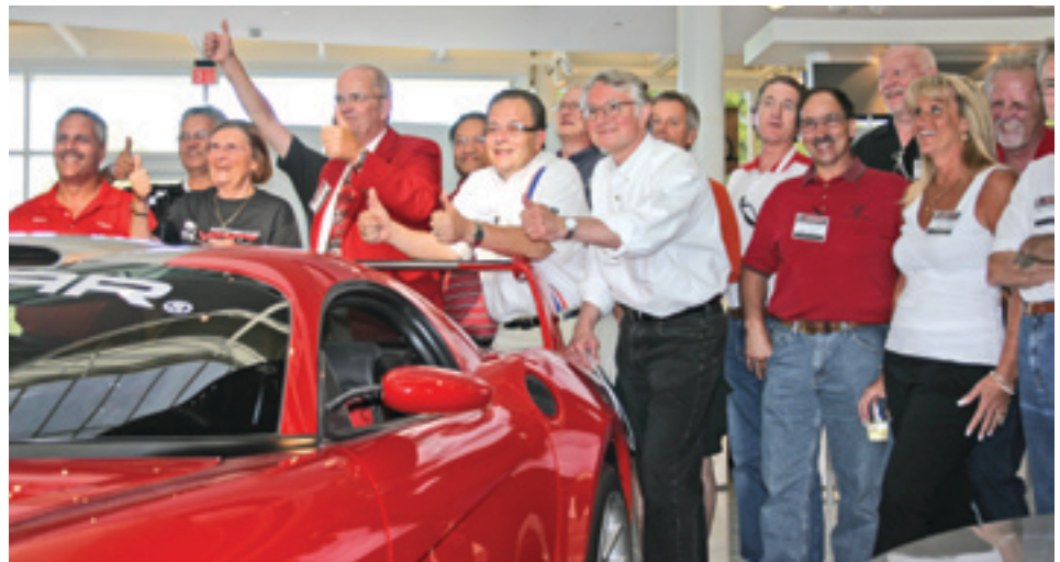
Members of the original Viper team were in attendance at the Museum gathering to celebrate the last current-generation Viper.