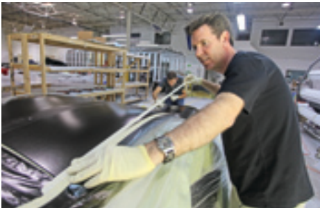
Trostle eyeballs the roof layout.