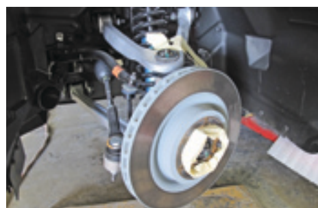
Ready for the gold brake calipers. 🇺🇸