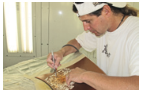
Airbrush art in progress.