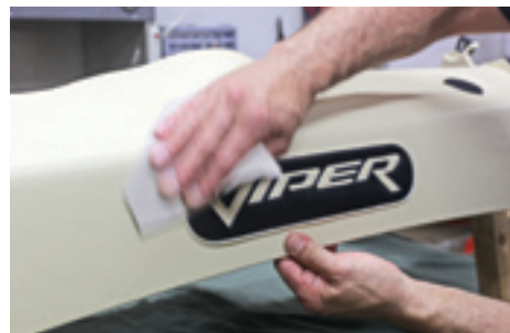
Burnishing the Viper logo on the Viper's bulkhead cover.