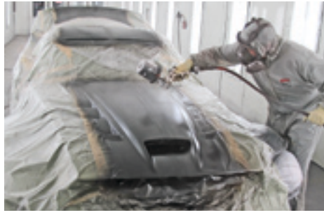
Prefix technician lays down base coat for stripes.