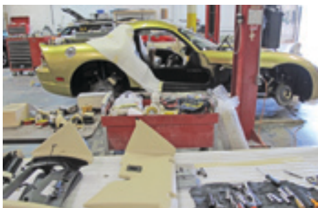
Tools of the trade.