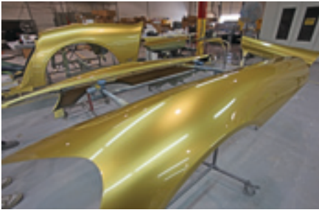
The base paint for the last Gen IV Viper is "Gleaming Gold." All the finishes are from House of Kolor in Picayune, Miss.