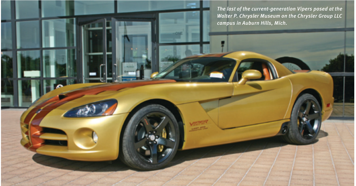
The last of the current-generation Vipers posed at the Walter P. Chrysler Museum on the Chrysler Group LLC campus in Auburn Hills, Mich.