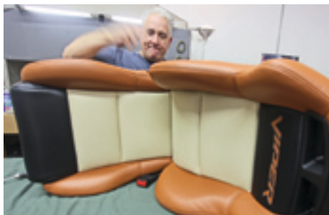
Assembling the custom leather seats.